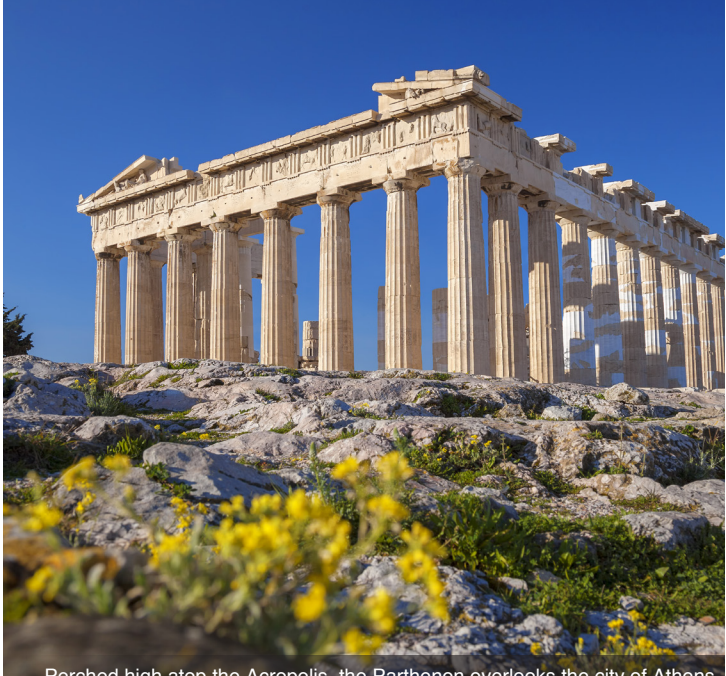
Perched high atop the Acropolis, the Parthenon overlooks the city of Athens

DAY 1 Depart the USA: Depart the USA on your overnight flight to Athens, Greece, a city with a history that dates back almost four millennia.