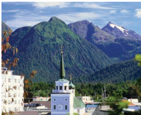
SITKA, ALASKA, UNITED STATES